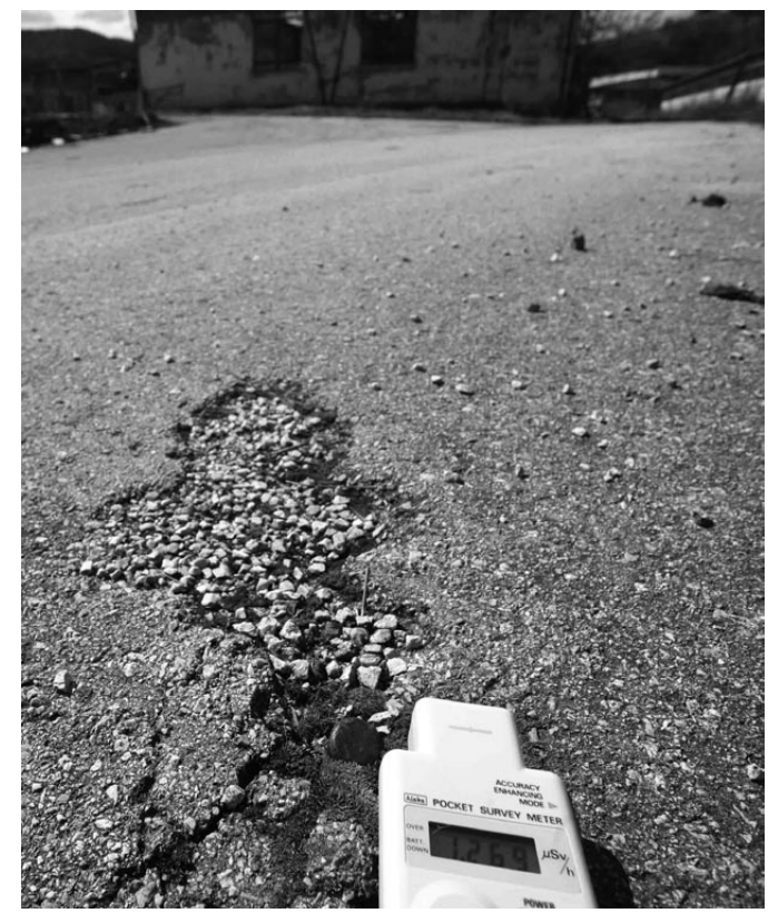
Steel peg marking impact hot spot on the tarmac apron at the TRZ facility, gamma reading is 40x background, April 2010.

Many of the workers have been with the company their whole lives. A number have died unusually young - the Director mentioned one who kept a penetrator as a souvenir because it released sparks when struck with a metallic object. He had died around 45 of lung cancer. While the Director knew that it was impossible to say for sure whether there was a connection, he said that the workers live with a constant sense of uncertainty. Many of them have to deal with concerns in their family about working at the site but are unwilling give up their income. It was described to us that any illness or ailment, whether it be asthma, kidney disease or a bad back, is accompanied by the thought in the back of their minds that it might be connected to the contamination. When they first heard about the contamination after the war, it did not seem to be too much of a threat as there were many other things to worry about, but as time has gone by, their concern has increased.73