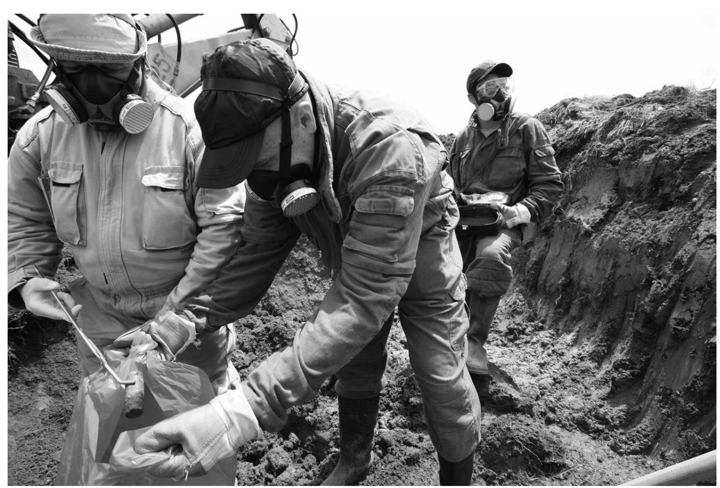
Serbian decontamination team removing the 'jacket' of a 30mm DU round at Borovac in 2007. Contaminated materials and soil from the site were removed to the Vinca Nuclear Institute near Belgrade for vacuum packing and indefinite storage in their low-level waste repository.