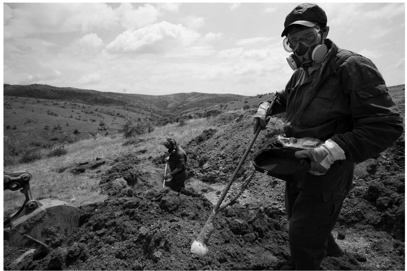
Serbian decontamination team sweeping soil for radioactive hotspots with the help of earth moving equipment at Borovac in 2007.